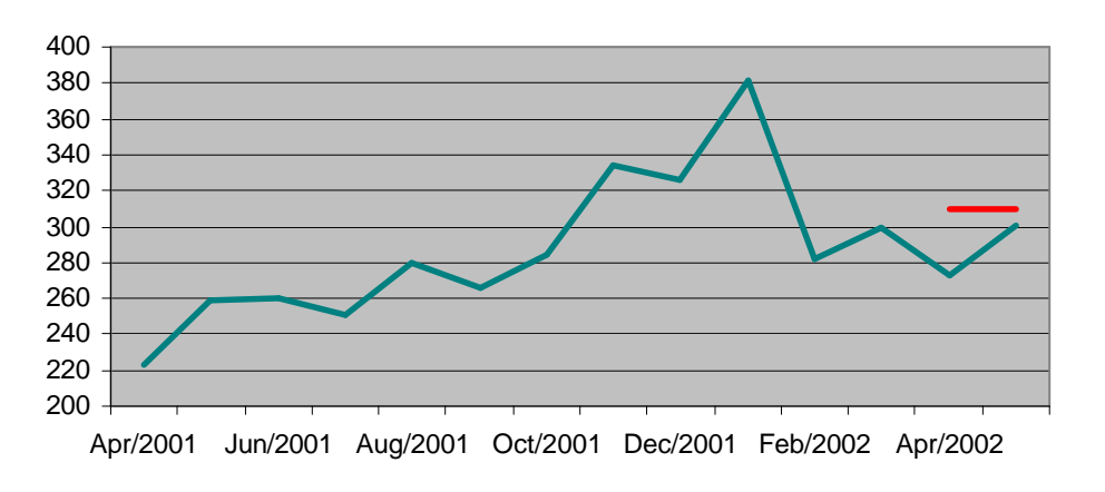
Chart 2: MPS Gun Related Violent Crime Offences

7 The level of gun related violent crime in May 2002 (301) remained below the 310 ceiling set in the policing plan (shown as a red line for April and May 2002 only).